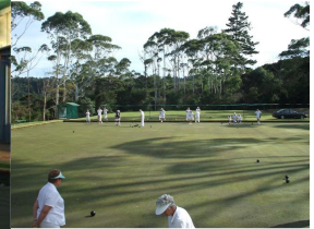
This photo just shows off how superb our bowling green truly is – taken during the match on 30 th