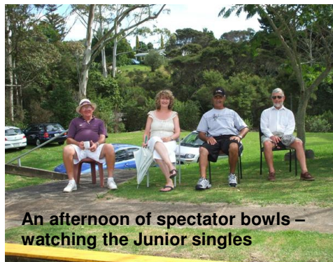
An afternoon of spectator bowls – watching the Junior singles