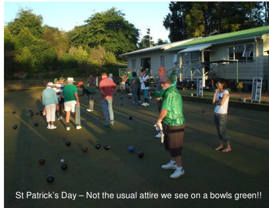
St Patrick's Day – Not the usual attire we see on a bowls green!!