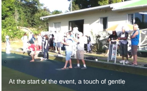
At the start of the event, a touch of gentle