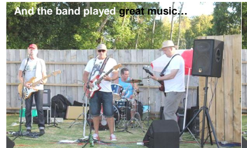
And the band played great music...